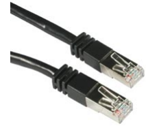
My station was almost worthless without these cables.