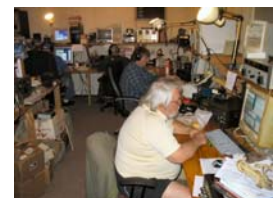
The W4MYA mega station hard at work

THERE WERE SOME BOLD STATEMENTS MADE BY PVRC OFFICERS ABOUT THE RUN FOR THE GAVEL IN 2006